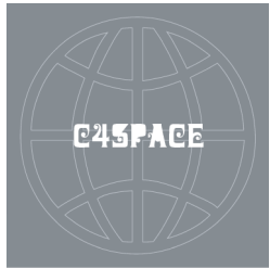
"solitude" 1997 helicopter rec.