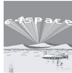
"3shots" 2002 helicopter rec.